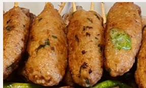
Hybrid Tsukune Sticks