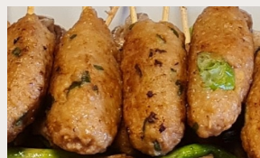
Hybrid Tsukune Sticks